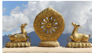
The Dharma wheel

The lotus flower - Even from a murky start, humans can achieve enlightenment.