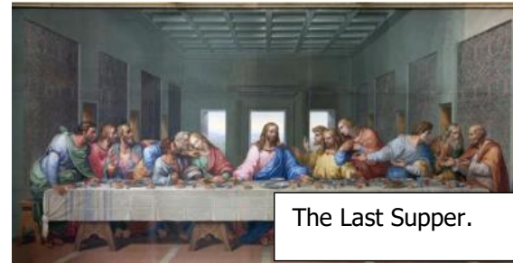
The Last Supper.